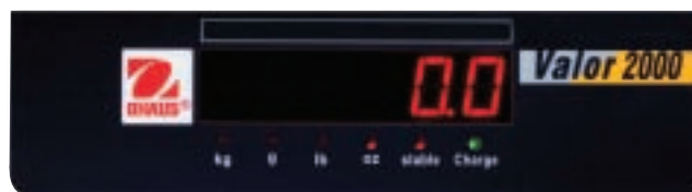
The Valor 2000 Food Processing Scale has front and rear LED displays, increasing throughput and efficiency by allowing multiple users to operate the scale at the same time.