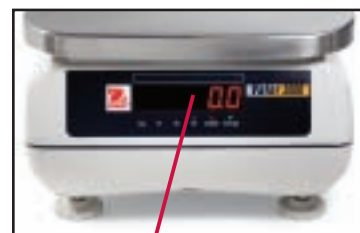
Bright, 7-Segment LED Display on Rear of Scale

Dishwasher Safe, Stainless Steel Weighing Pan