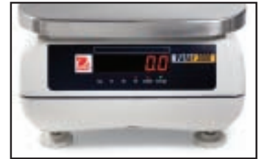
Valor 2000 with standard rear LED display